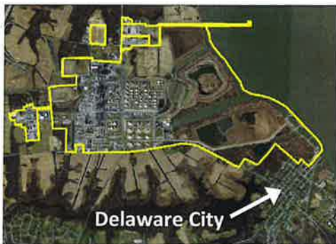
Six of the sites (outlined in yellow above) are located just northwest of Delaware City.

Heavy industrial development are facilities that use structures like smokestacks, tanks, chemical processing equipment, and waste-treatment ponds to run their business. They usually take up more than 20 acres of land. For example, a chemical manufacturing plant is heavy industrial development. Not all heavy industrial development is allowed in the Coastal Zone. For example, oil refineries, incinerators, steel plants, and liquefied natural gas terminals are still not allowed, even on the 14 sites.