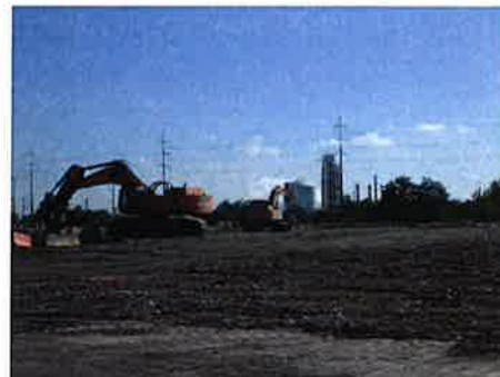
Former EVRAZ/Citi Steel site in Claymont, one of the 14 sites where new heavy industrial development could happen.

Heavy industrial development on any of these sites must be approved by DNREC under a new permit called a "conversion permit". DNREC is in the process of writing new regulations for conversion permits and is reaching out to communities for input.